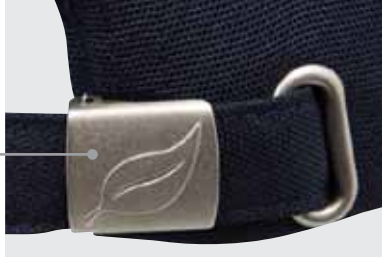
Embossed buckle with Eco-Choice symbol